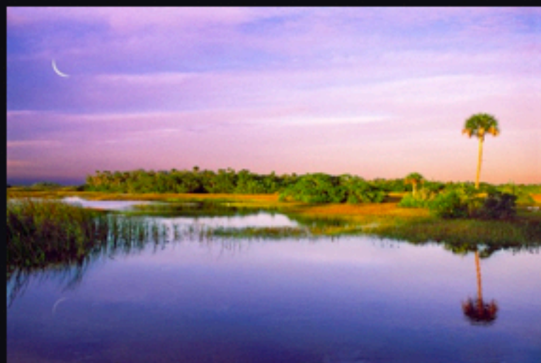
"Violet is the Night"