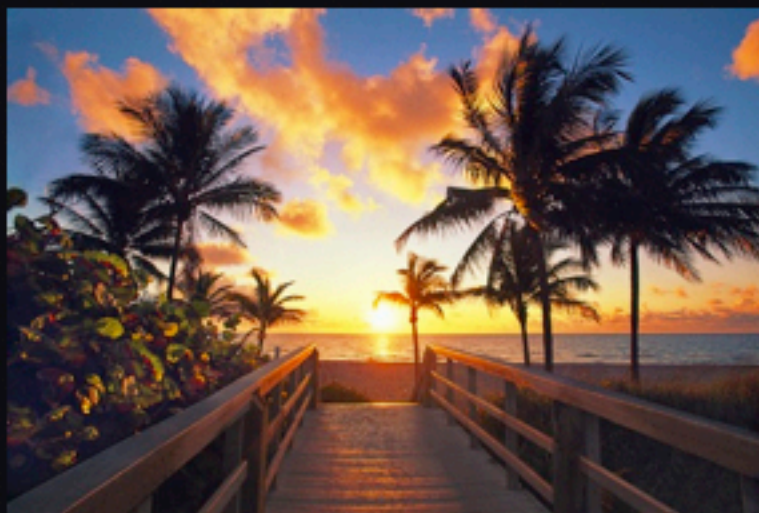
"Pathway to Paradise"