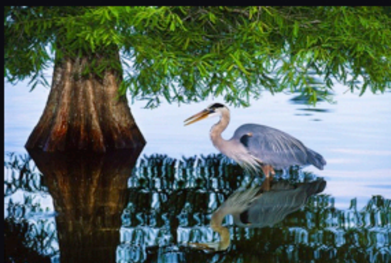
"Audubon Moment 2"