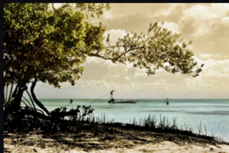
"Flats Fever - It's Catching!"